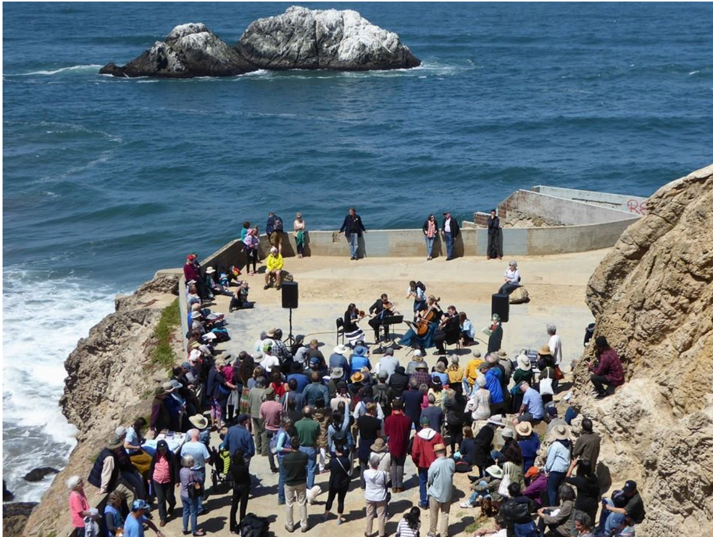
2016 OPG of Cypress String Quartet