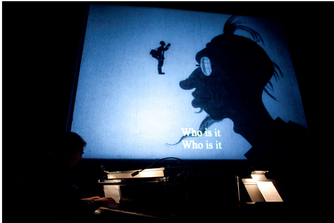
2015 OPG of Silent Film Festival

Project goals, vision and process demonstrate originality, clarity, and depth of concepts; and are relevant to past work.