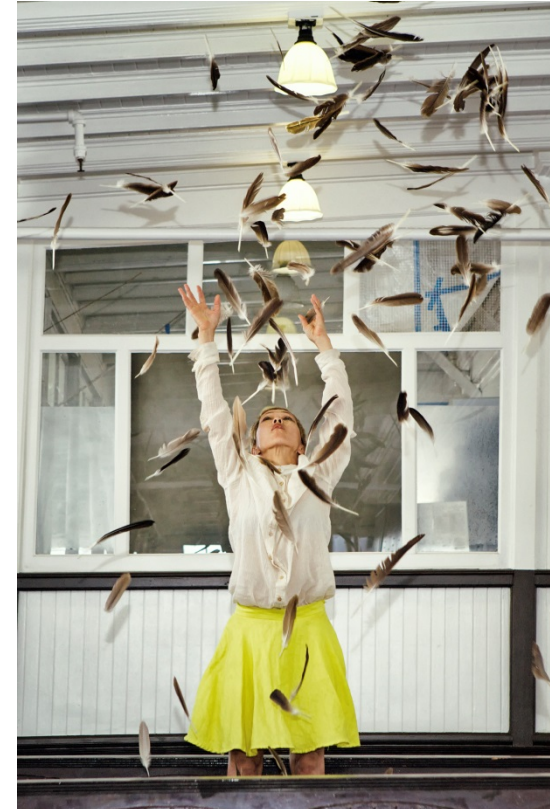
2015 OPG of Dancers Group