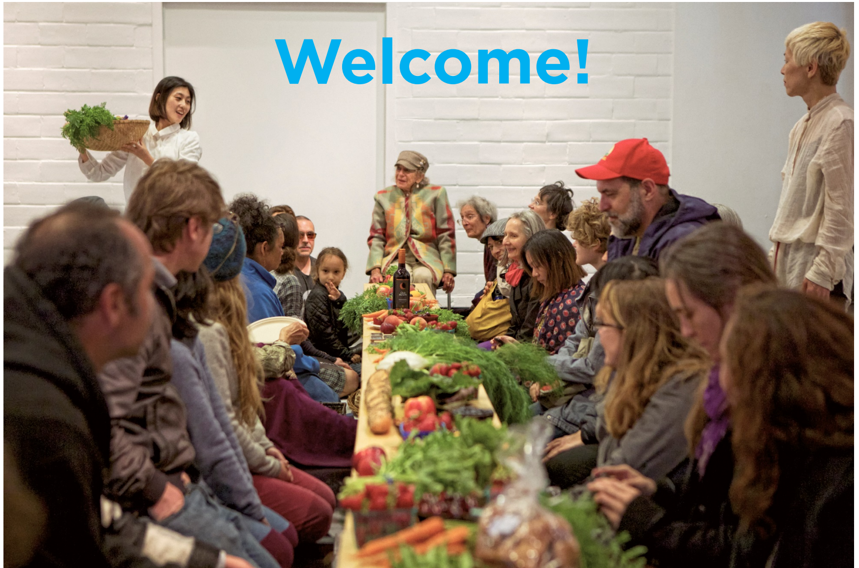
2015 OPG of Dancers Group